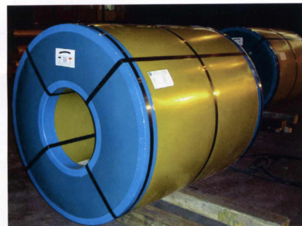
Hot-rolled galvanized sheet