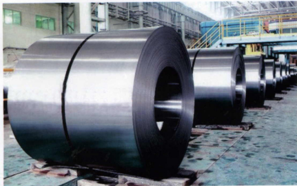
High-quality steel production facility