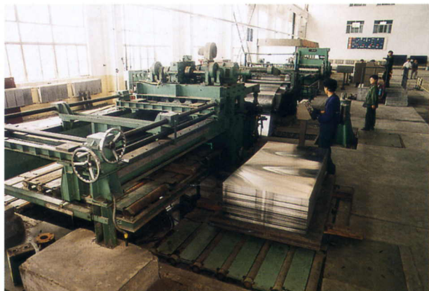
纵横联合剪 vertical and horizontal joint shears