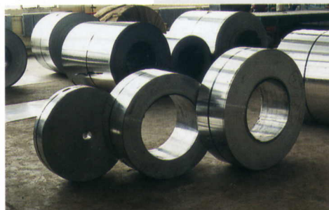
带材产品 strip coils