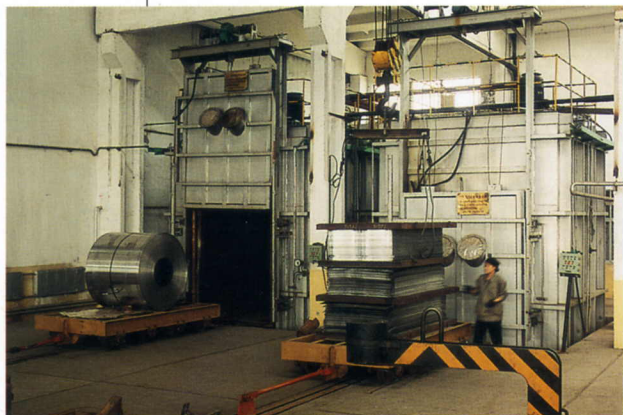
13吨退火炉 annealing furnace with a capacity of 13 tons