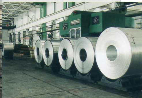
待轧坯料——铸轧卷 raw plate coil