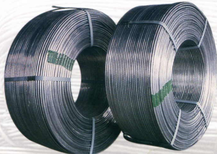
铝钛硼丝产品 Al-Ti-B wire

我厂研制生产的铝钛硼丝晶粒细化剂,主要用于铝及铝合金晶粒细化处理,该产品填补省内空白。