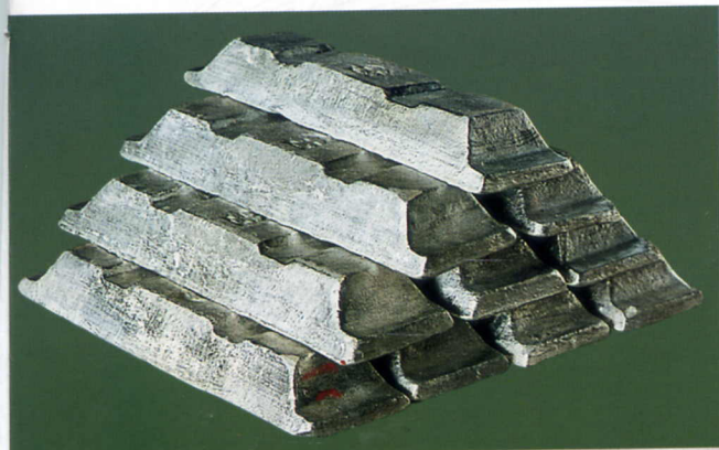
铸造铝合金 Ingots for casting