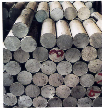
圆铸锭 Round ingots