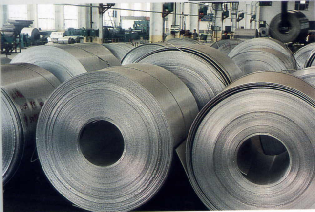
铸轧板 Cast-rolling plates