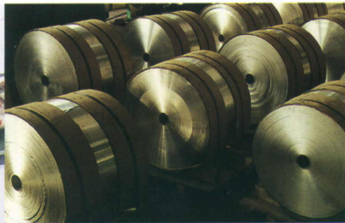
铝塑复合带产品 Compound Al-plastic strip